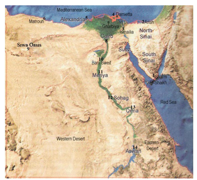
Fig. 1. Map of the sampled localities.

Sixty-nine African Common Toads were obtained from the fourteen locations in Egypt, with between four and seven toads obtained per locality (Fig. 1). These locations were numbered from 1 to 14, with the number of toads from each shown in parentheses: 1. Sharm El-Shaikh (4); 2. Arish (4); 3. Ismailia (5); 4. Damietta (6); 5. Alexandria